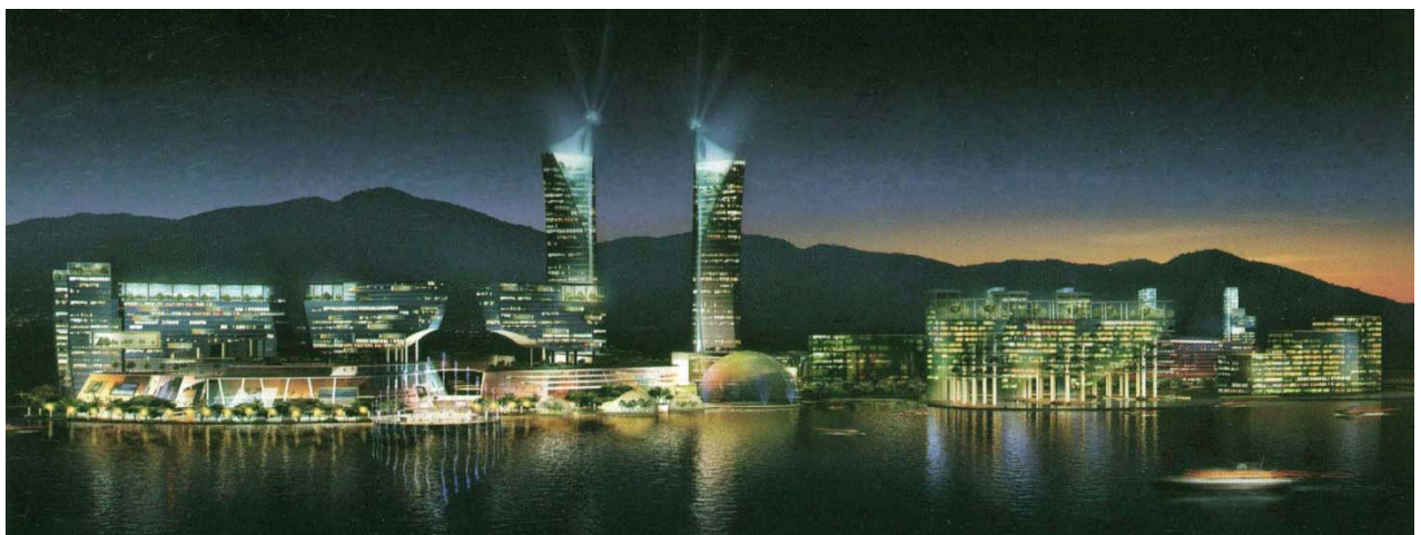
Overall View of The Light Waterfront, Penang