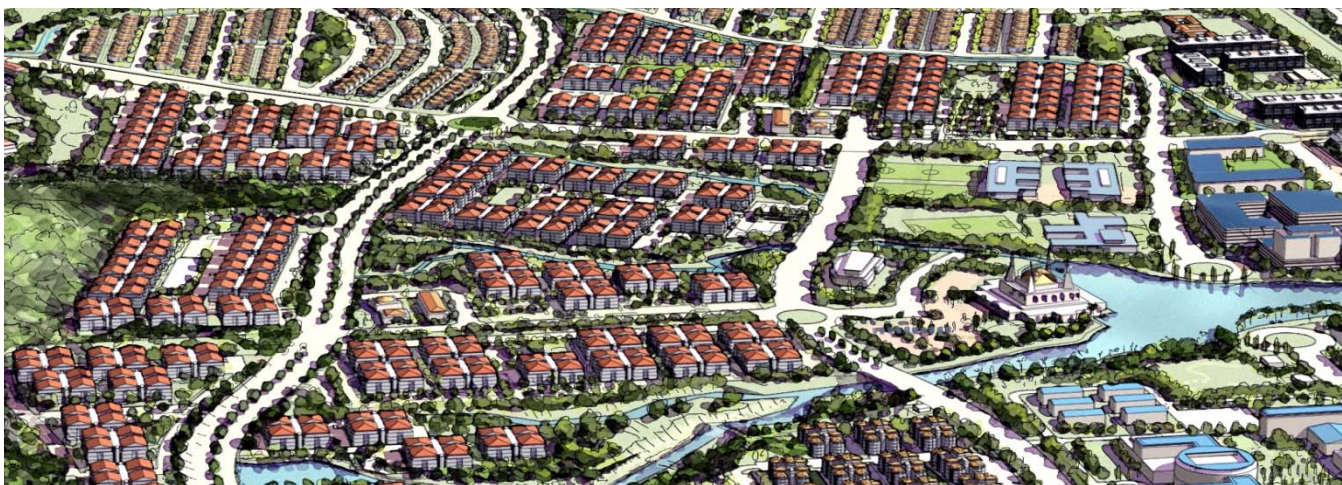
Master Planning of New GHQ Complex, Islamabad, Pakistan