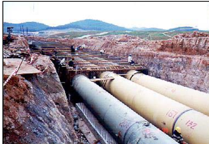
1600MM AND TWIN 1800MM DIA. STEEL PIPE