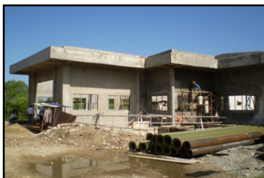
Refurbishment of Pumping Station