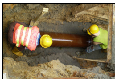
Sewage Pipe Laying